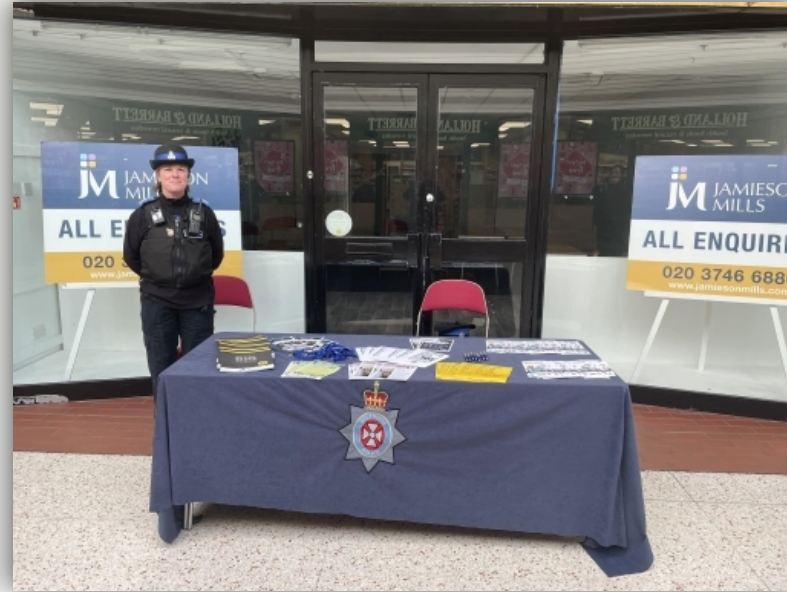
+ 2 Fund Raising evens / 4 Community Consultations