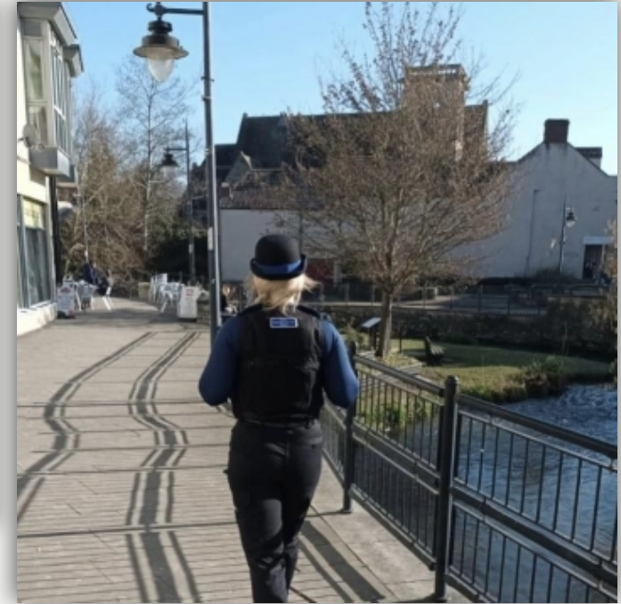
+ 35 ASB patrols and Surveys

+ 21 Housing visits in company with the respective Housing Association