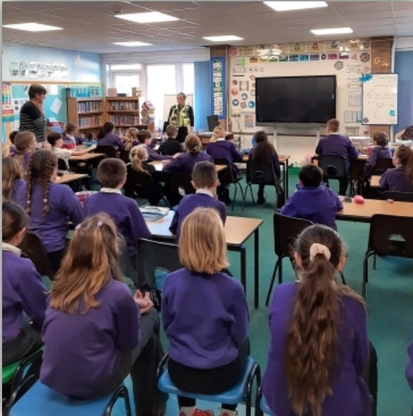
+ 15 School Talks / Visits

Since 1 st January 2023 the Neighbourhood Policing Team have completed 73 Community Engagements within Chippenham.